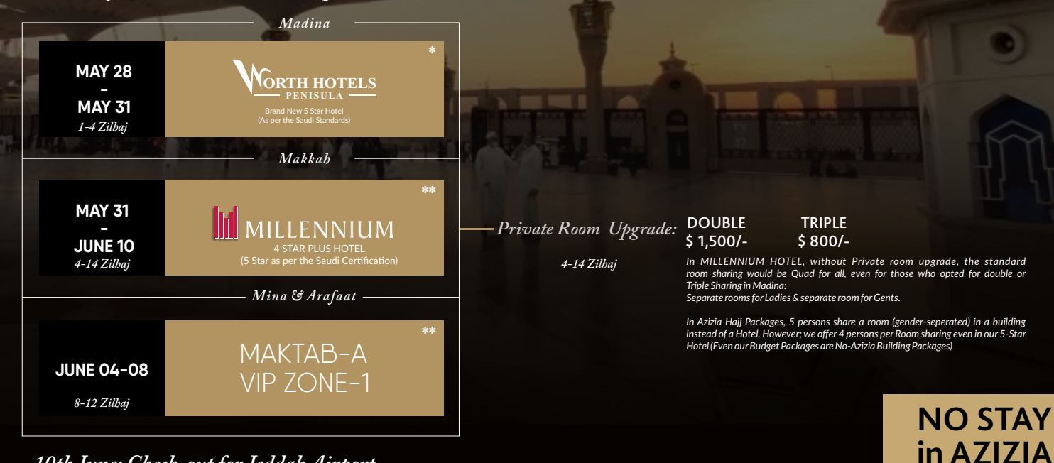
10th June: Check-out for Jeddah Airport

* Half Board Meal (Breakfast & Dinner) ** Full Board Meal (Breakfast , Lunch & Dinner)